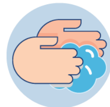
Wash Hands Often