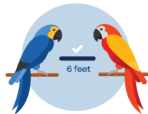
Stay 6 Feet Apart